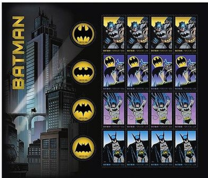
THE BATMAN SHEET ISSUED IN EIGHT DESIGNS. FOUR “ROUND” STAMPS DEPICTING VARIOUS “BAT SIGNALS” AND FOUR STAMPS DEPICTING THE VARIOUS BATMAN OUTFITS.

The Batman Limited Edition stamps were issued as Forever stamps and always will be equal in value to the current First-Class Mail 1-ounce price.