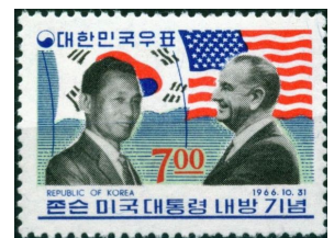
KOREA (Scott #544) (JOHNSON VISIT-1966)