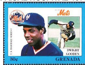
GRENADA (Scott #1666b) (GOODEN-ISSUED IN 1989)