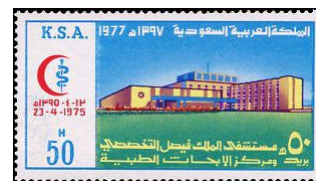
SAUDI ABARIA (Scott #765) (FAISAL HOSPITAL-1977)